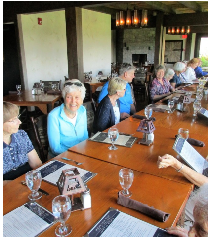
Luncheon outing to Mountain Top Inn

It was a busy summer at The Gables with an abundance of entertainment, outings, and barbecues taking place. Here's a look back at some of the highlights from the past few months: