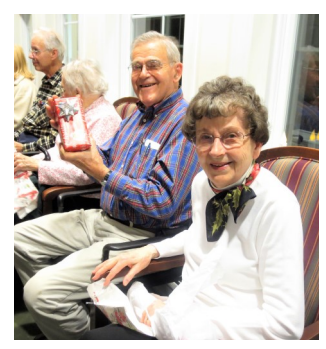
Presents for all residents!

As 2017 comes to a close, Gables residents have been busy celebrating the holiday season.