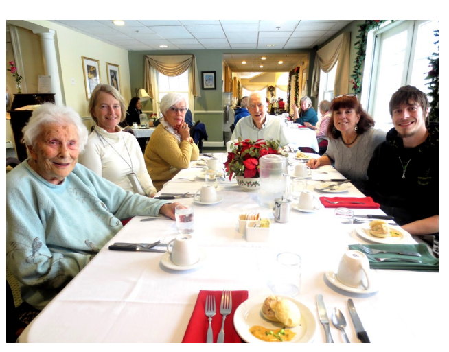
Wishing you a happy and healthy 2018!